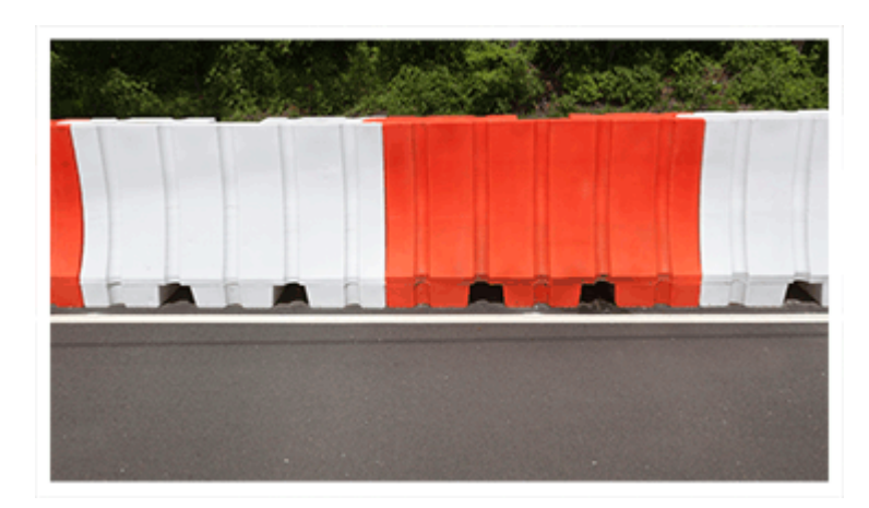
Figure 2: Interconnecting channelizing device

For example, continuous physical barriers are made from concrete or deformable elements filled with ballast and reinforced by steel bars. Concrete barriers must not be placed at an angle or perpendicular to the direction of traffic.